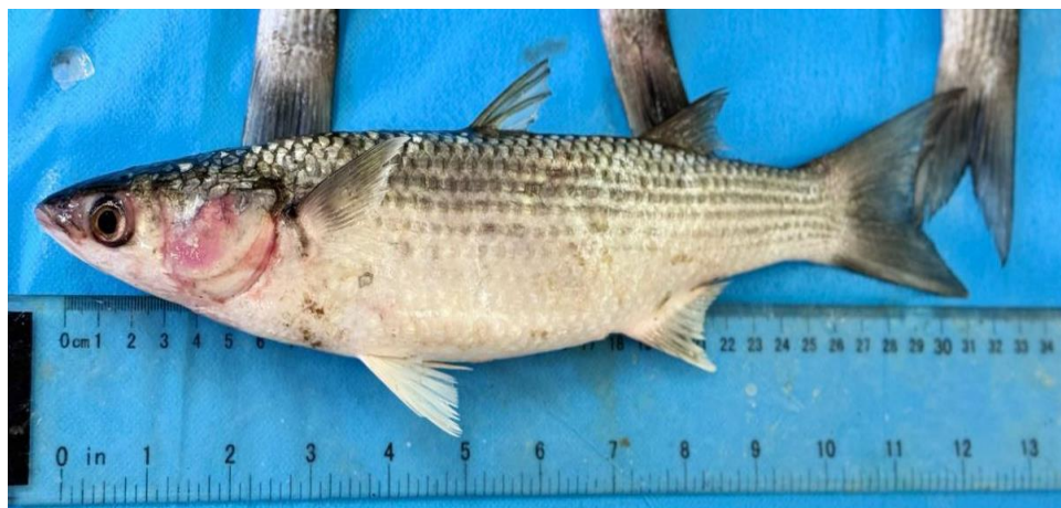
Fig. (2). The species study ( Liza carinata ) from Susah harbor – eastern Libya in November 2024.